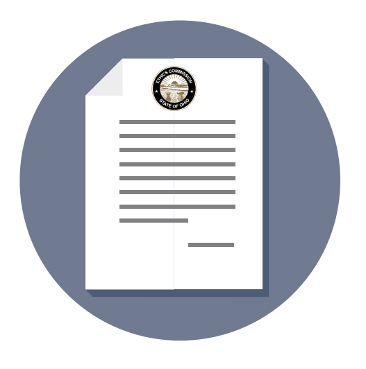
Advisory Opinion 85-004

You may also contact the Ohio Ethics Commission if you have additional questions.