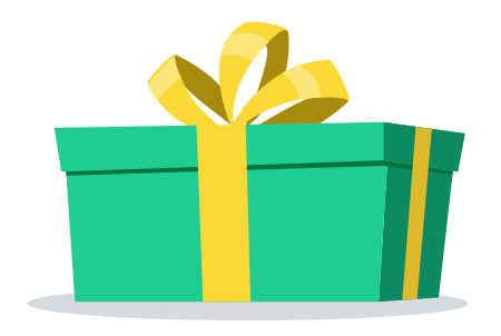
Gift Information Sheet

Last year, the Ohio Ethics Commission addressed many of the mostly commonly asked holiday gift questions in our 2016 4th Quarter newsletter. Feel free to peruse it for a more in-depth but user-friendly guide regarding holiday gifts and public service.